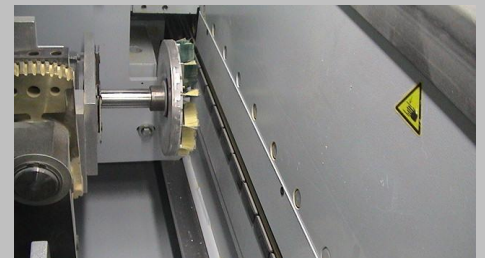
Wood sanding with disc sanders inserted in an edge sanding machine