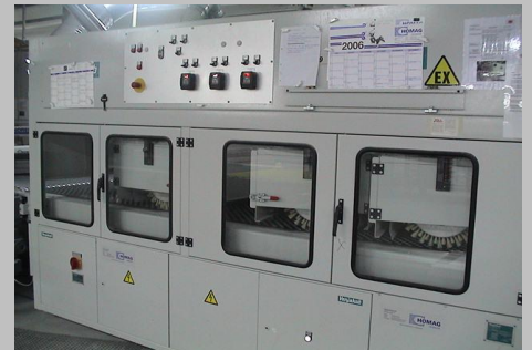
Surface sanding with a Venjakob brush sander