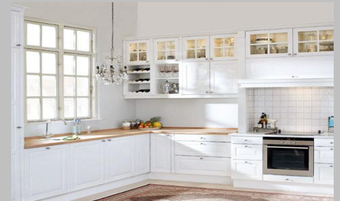
A completed kitchen with MDF doors in a trendy design