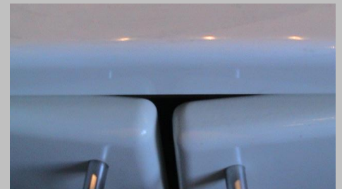
MDF doors seen in detail.