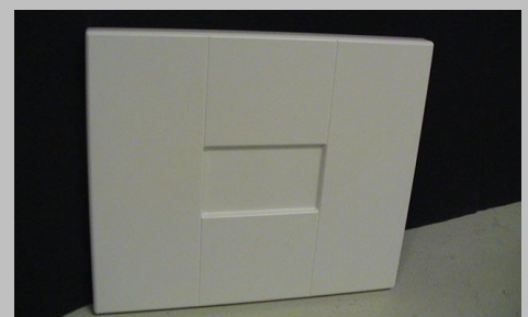
MDF doors after finished treatment of edge surfaces.