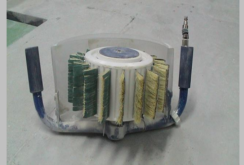
2-handed motorcycle in the intermediate sanding of the edges