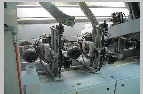
Disc sanders installed on the edge sander