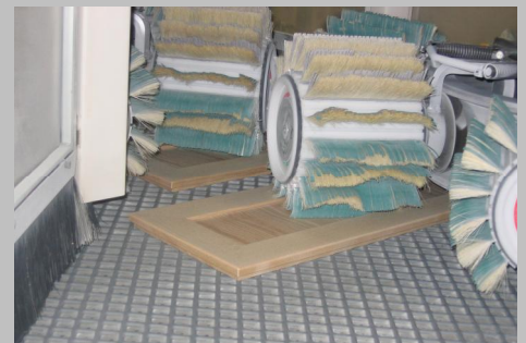
Brush sander equipped with Flex Trim sanding heads and sanding strips.