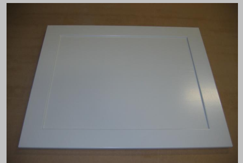
Finished, white-painted MDF door.