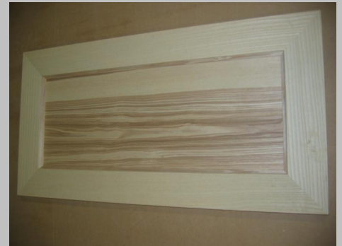
Sanded ash wood door without hand sanding being used.

Surface sanding on profiled doors in through feed