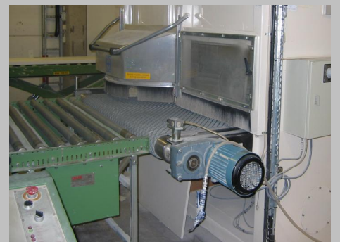
Brush sanding machine.