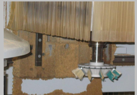
Sanding solution implemented on a CNC machine.

Surface sanding on profiled doors in through feed