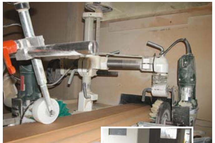
The two discs at work on the edges of the moulding.