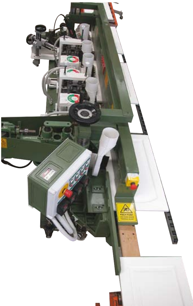
Panels being fed through the machine.

I have found in most successful outcomes there is always an underlying strategy to improve quality