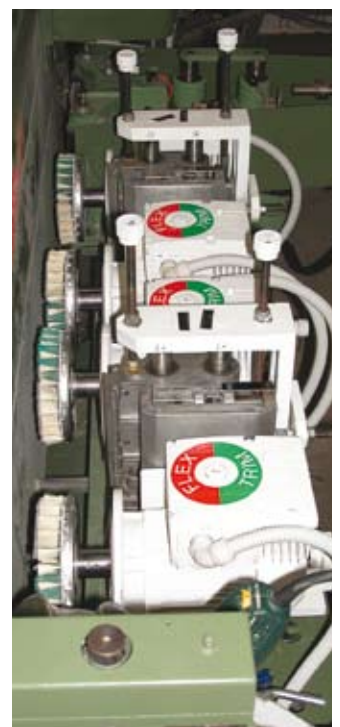
Top view over the four disc heads.

It should also be noted that every solution is not exactly the same because of changes in materials and the quality of the machining.