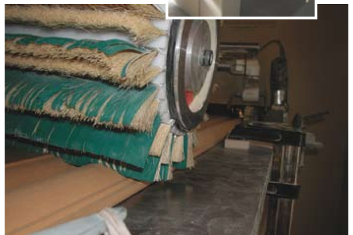
The 300mm drum at work on the face of the moulding.