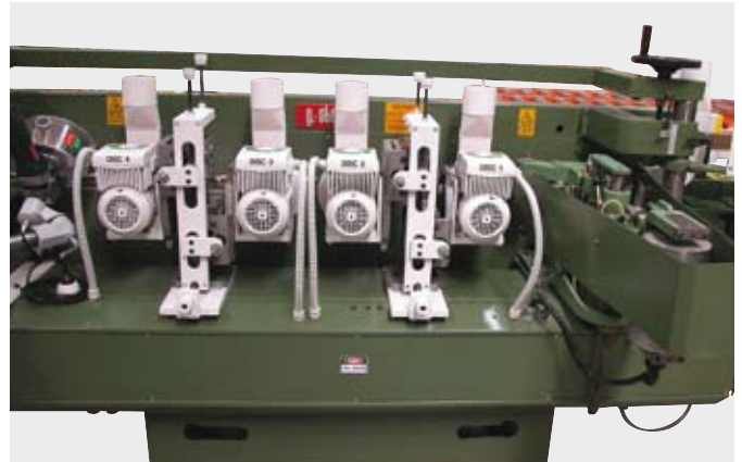
View from the rear of the retro edge sander.

Early this year we completed the first Retro Fit, in Australia, of a used edgebander into a six (6) headed edge sander utilising Flex Trim sanding heads. It is very important to note that in a retro the feed track must be in very good condition to justify the retro