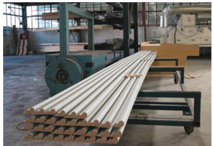
Moulding after sanding and painting.

1b) The circled area on right sample illustrates the cleaner lines of the Flex Trim sanded profile and the more even and economically painted surface.